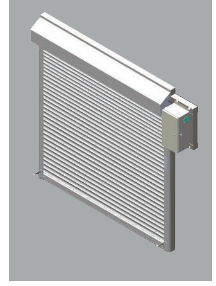
Rendering: Allura® Residential Exterior Shutter system