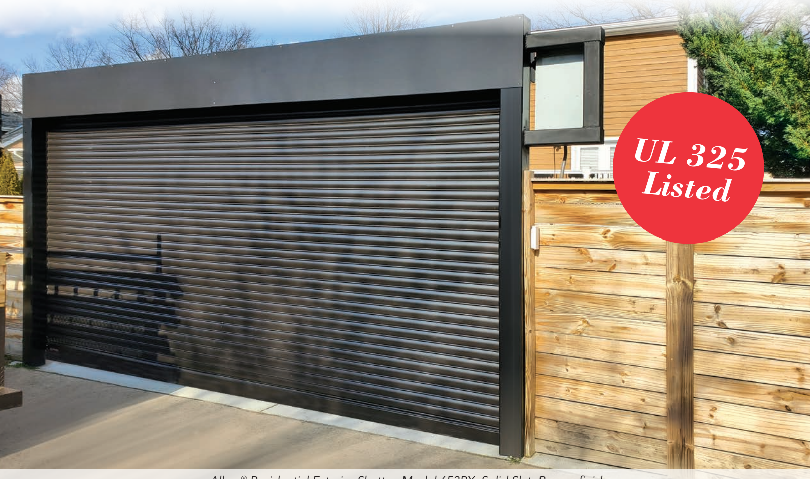
Allura® Residential Exterior Shutter, Model 653RX, Solid Slat, Bronze finish